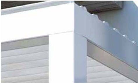
Perimeter rain gutter and 8"x8" water drain uprights