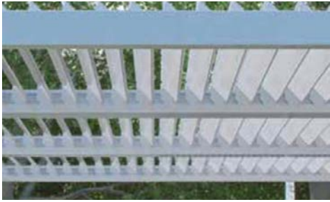
Adjustable slats from 0° to 140°.