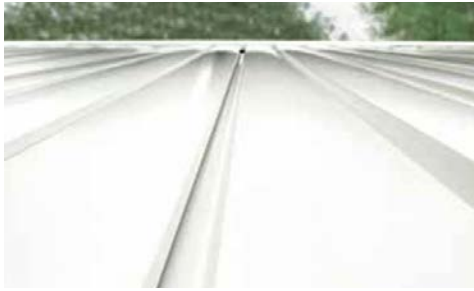
Water-drain channels designed along the slats