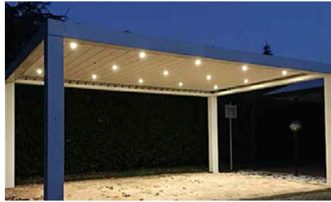
Optional led lights.