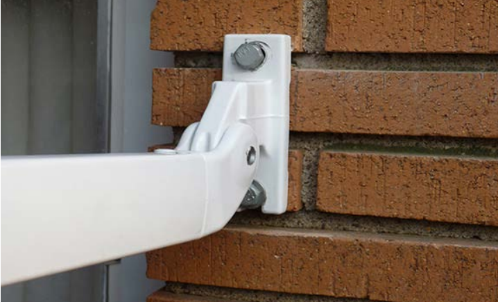
Capri's arms are spring loaded to maintain constant tension in the fabric even under moderate wind loads.