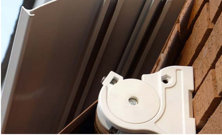
Capri brackets are very discrete and designed to fit in 4". They can be installed either on walls or under a soffit.