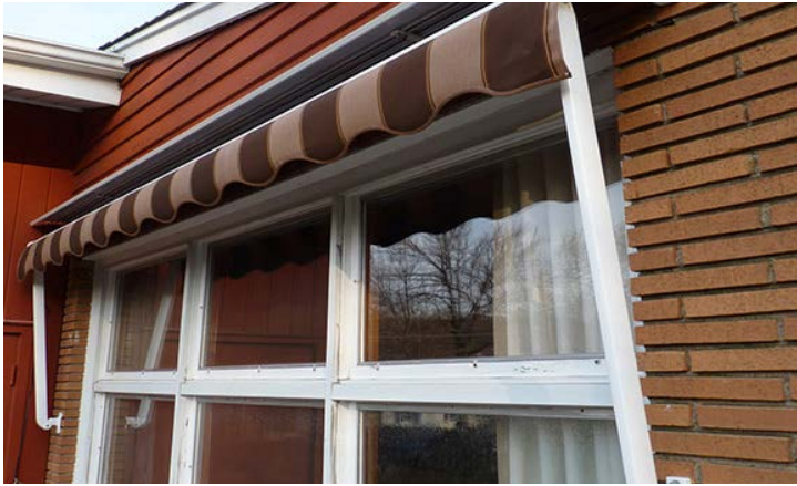
When completely rolled up, Capri rests discretely above your window.